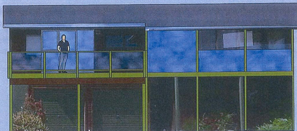
Front Elevation (Scale 1:50)